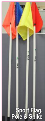
Sport Flag, Pole & Spike